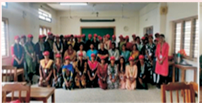
The Chief Minister Trophy of Tamilnadu Kabaddi match for women was held in VIT Vellore, Ms