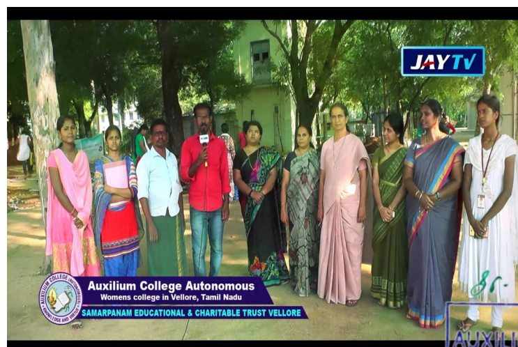
NSS Programme Officers and Volunteers

PRINCIPAL AUXILIUM COLLEGE (Autonomous) Gandhi Nagar, Vellore - 632 006. Vellore District, Tamil Nadu.