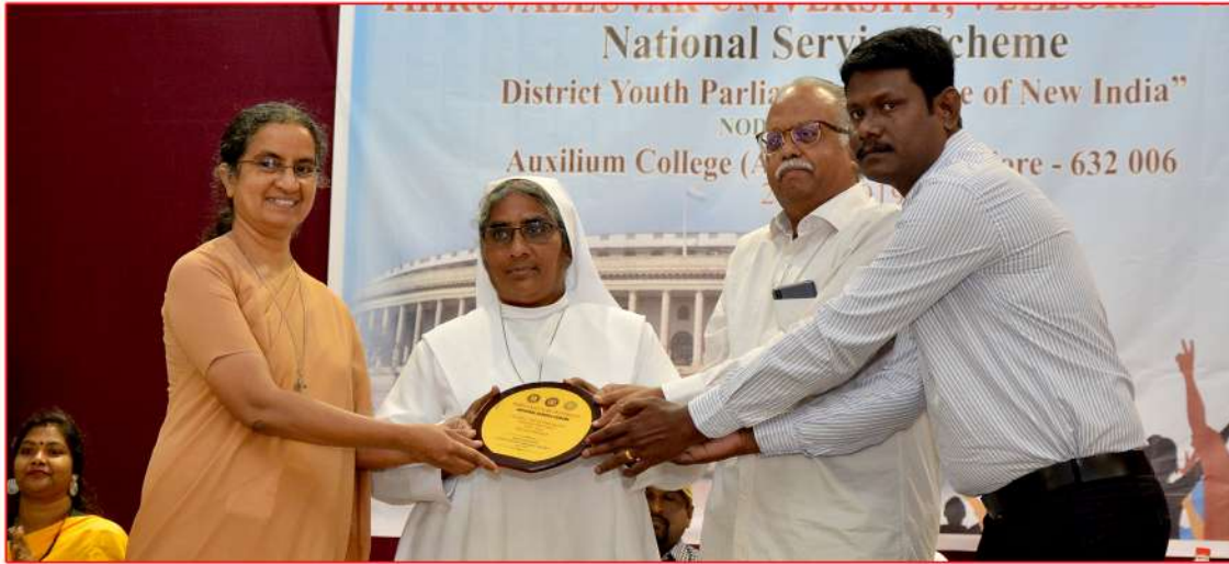
Nodal Institution - Auxilium College (Autonomous) Vellore.