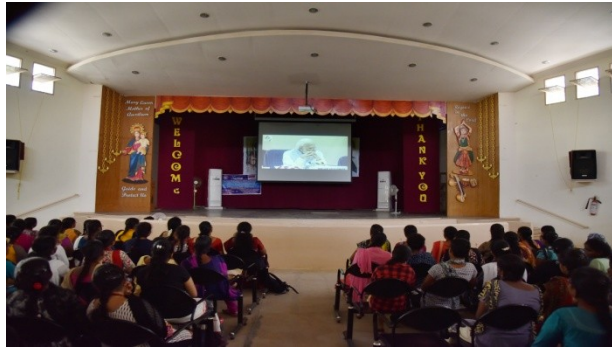
Students watching the Live telecast of the Honourable Prime Minister's speech during the valedictory function of National Youth Parliament festival