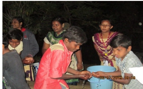
Don Bosco Tribal Centre for Boys