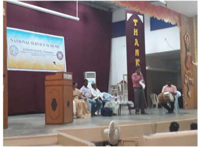
Input Session and Awareness Folk Songs Tamil Nadu Progressive Writers and Artist Forum