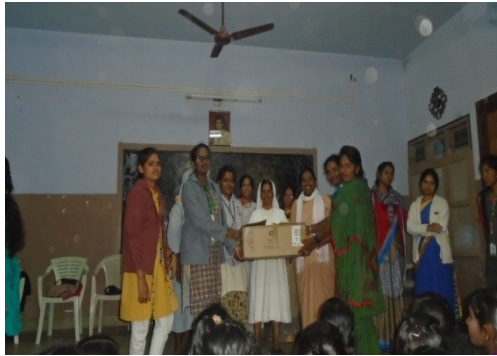
Visit to Auxilium School for Girls