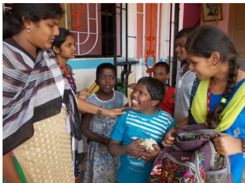
Visit to Sneka Jothi- a School for Mentally Retraded Children