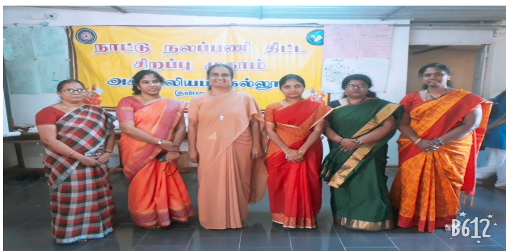
Principal and NSS Programme Officers