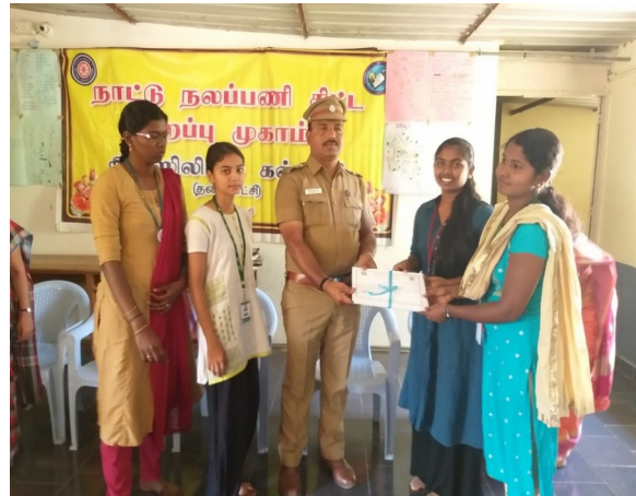
Sub-Inspector of Police, Jamanamarathur